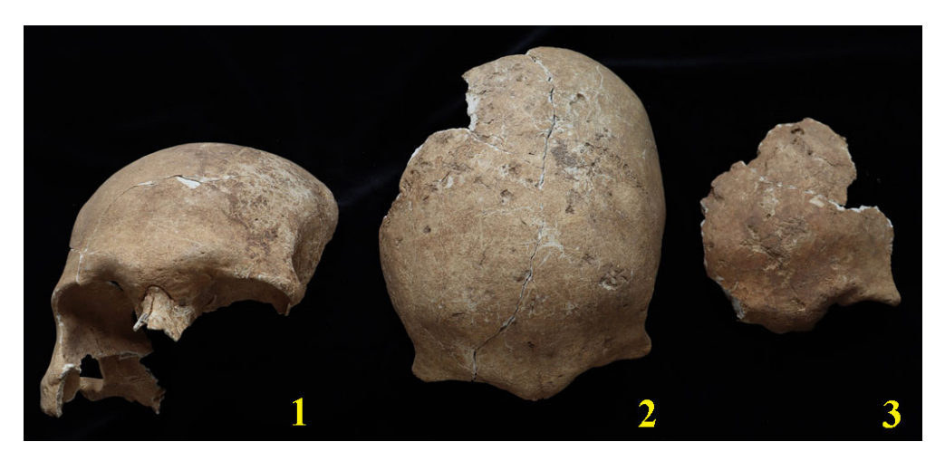
Fig. 1. Grave N 2, skull fragments. 1.1. Frontal bone, fragments of both parietals, nose bones and right zygomatic, next to the pelvic girdle of the skeleton in primary position. 1.2. Fragment from calva, South-East corner. 1.3. Fragment from frontal bone, North-East corner

Grave N 2 contains bones from six individuals. A skeleton of one male, at ca. 50-60 years is uncovered in primary position. The remaining individuals are presented by singular reburied bones, which defined other three males (Fig. 1), two matures (40-60 years) and a younger one at about 20-30 years, an adult female and a child at about 10 years of age.