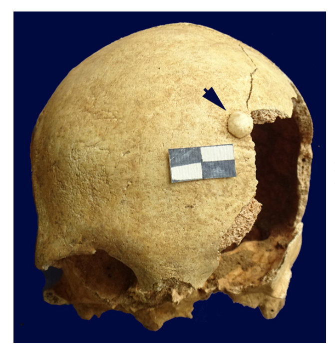
Fig. 3. Grave N 3, calvaria , arrow – osteoma

ascertained age in the period. Possible invalidisation could have caused the defect on the condyles of right femur of the individual in the primary position from grave N 2. Additionally, in movement difficulties in the knee joint and possible overloading of adductors, developed the myositis on the linea aspera.