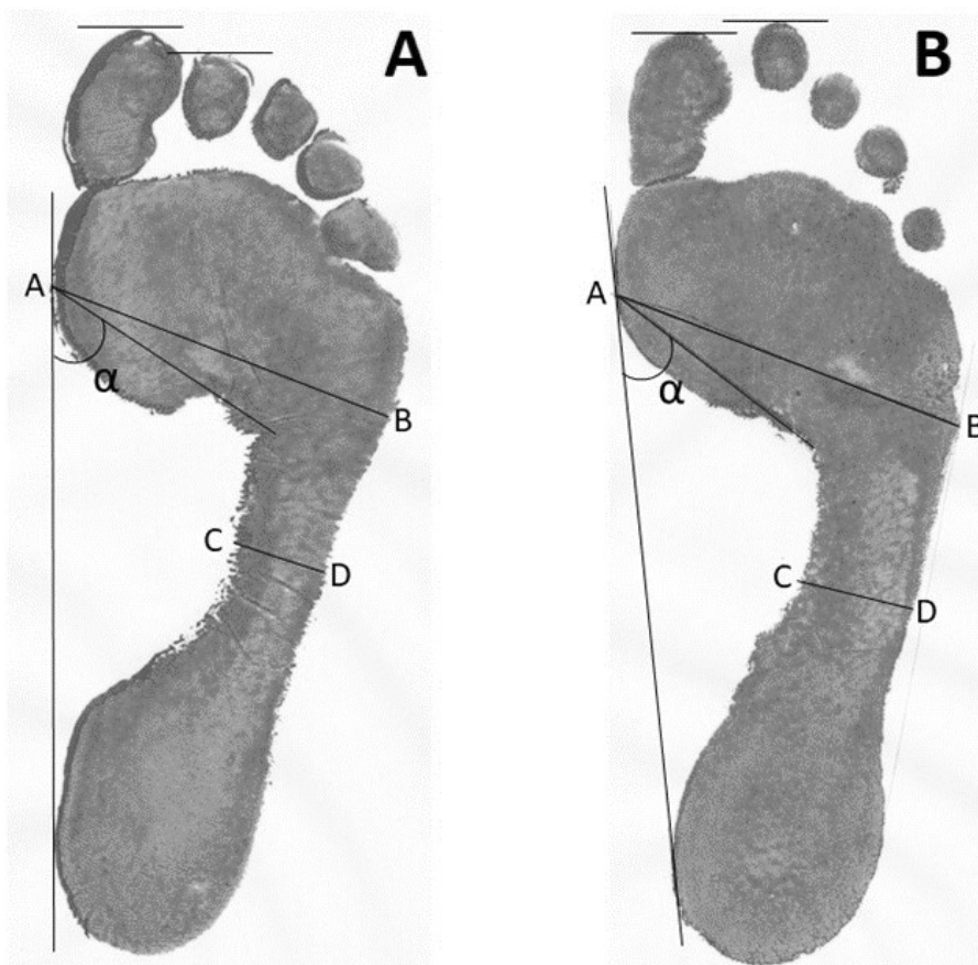
Fig. 2. A. Morton's toe negative footprint. B. Morton's toe positive footprint (second toe is longer than the first one). \alpha – Clarke's angle. AB line – the maximum support width of the metatarsals; CD line - the minimum support width of center of the arch. Chippaux-Smirak index = AB/CD \times 100\% .